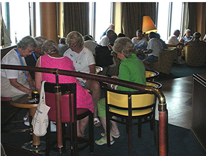
Trivia teams concocting the answers for the questions.