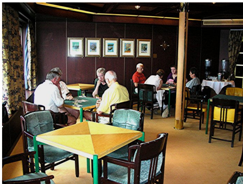
The Hudson Room is where card players gather.