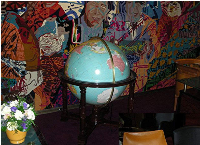
A large internally lighted globe is available in the library.