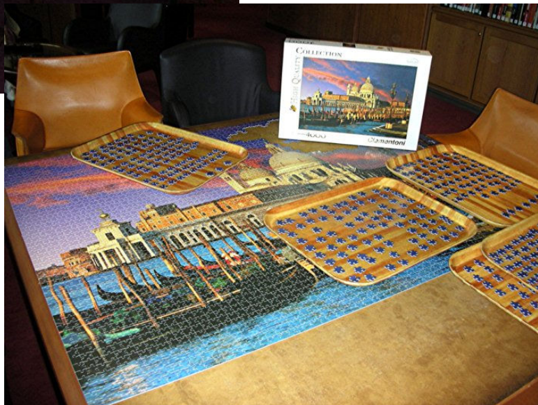
A jigsaw puzzle is usually at some stage of assembly on a table in the library.